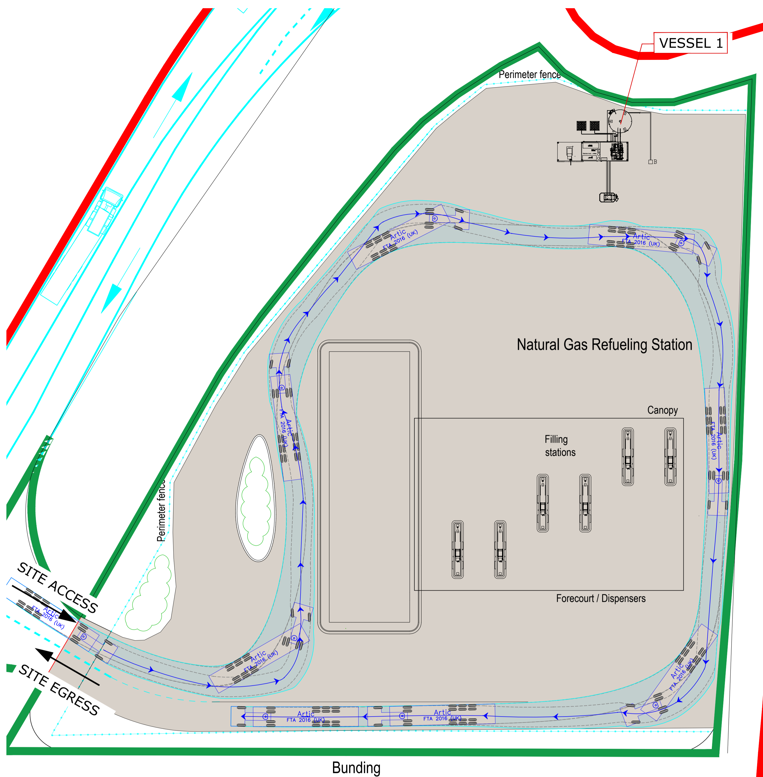
Plan of Phase 1 stage; Including Temporary 'Skid' station facility, Secure compound and fuelling Islands (no pumps or tanks).